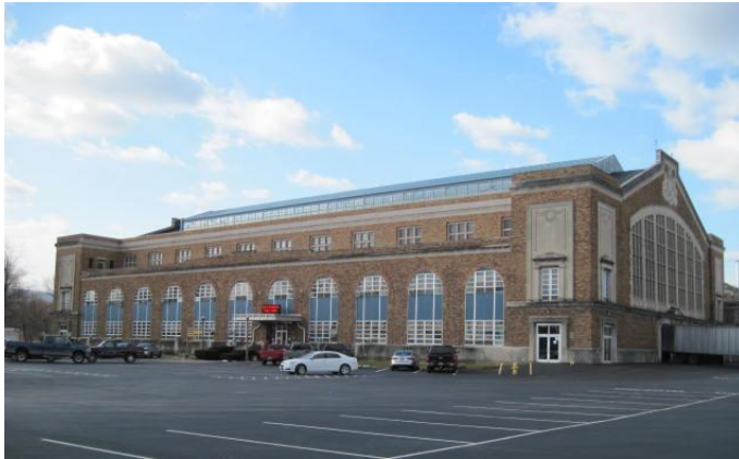
Wilkes Barre Readiness Center 280 Market Street Wilkes-Barre, PA 18704

The Wilkes Barre Readiness Center (RC) is owned and operated by the Commonwealth of Pennsylvania. The Readiness Center is available for rental for official and unofficial uses subject to availability. The RC is ideal for many unofficial uses such past rentals include circuses, boxing events, pet expos, job fairs and wrestling tournaments. More intimate rentals include graduation parties, charity events, Girls Scouts and little league tryouts.