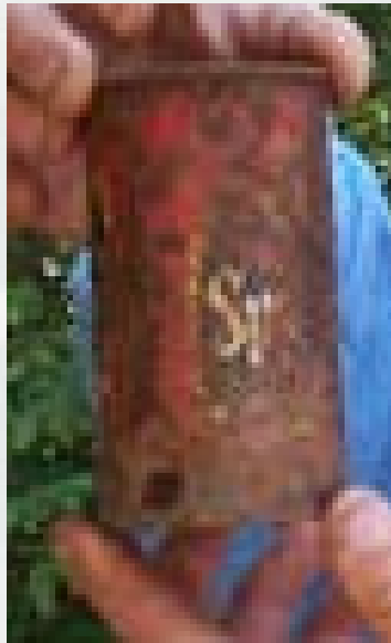
Old Rusty Steel Can

UXOs can have familiar shapes; for example metal pipes, soda cans and even golf balls.