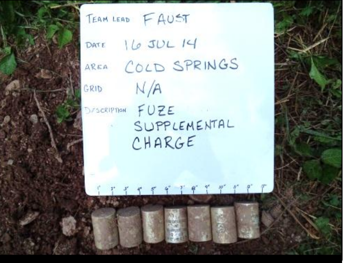
Discarded military munitions – supplemental charge for artillery shell, Cold Spring herbaceous opening

UXO – 81mm, high explosive, M374, Area C