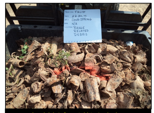
Range related debris from Cold Spring herbaceous opening